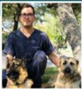
Owner, Founder, Veterinarian (DVM)

www.petsfirst.net/ 805-372-0800 info@petsfirst.net